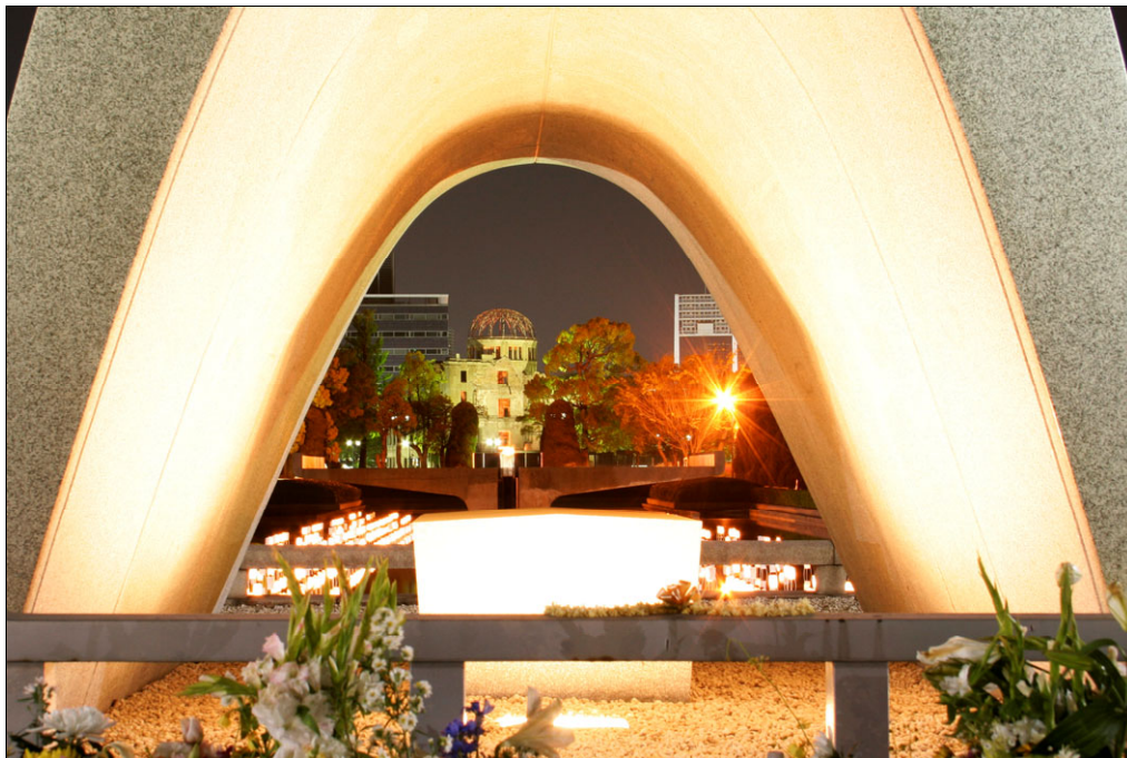
Cenotaph, Peace Park , Hiroshima