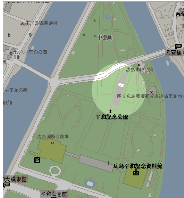
Peace Park, Hiroshima.

Under the cenotaph lies a stone chest. The chest holds a registry of the names of those who died from the bomb. As of August 6, 2002 the list totals 226,870 names. Since there are still some survivors, the list is still growing.