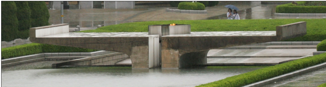
Flame of Peace, Peace Park, Hiroshima

The pedestal of the Flame of Peace was designed by the same person who designed the Cenotaph. It is meant to symbolize two open hands together at the wrist, palms facing